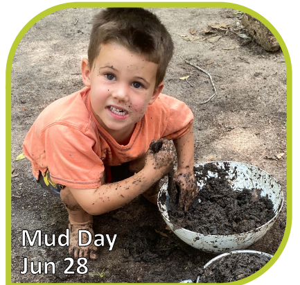
Mud Day Jun 28