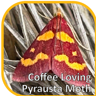
Coffee Loving Pyrausta Moth