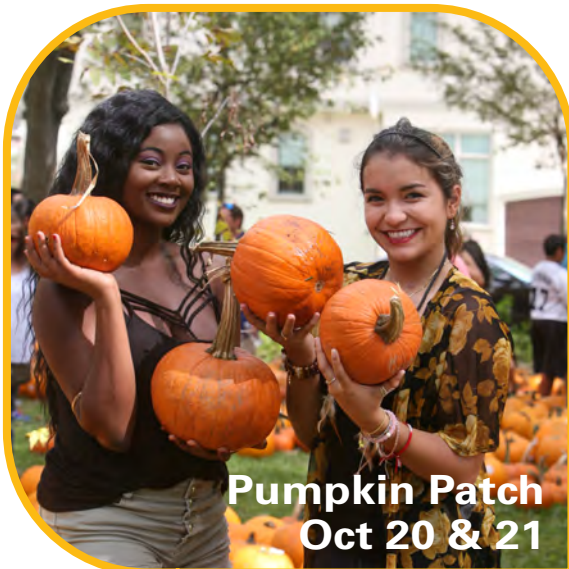
Pumpkin Patch Oct 20 & 21