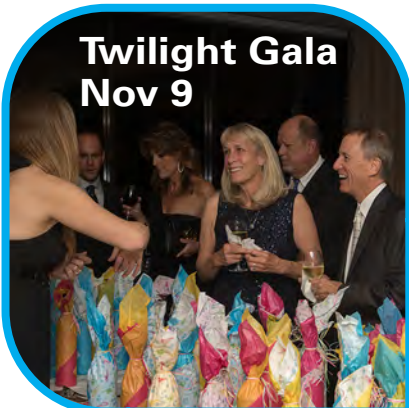
Twilight Gala Nov 9